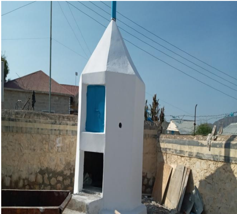
BRH New Incinerator